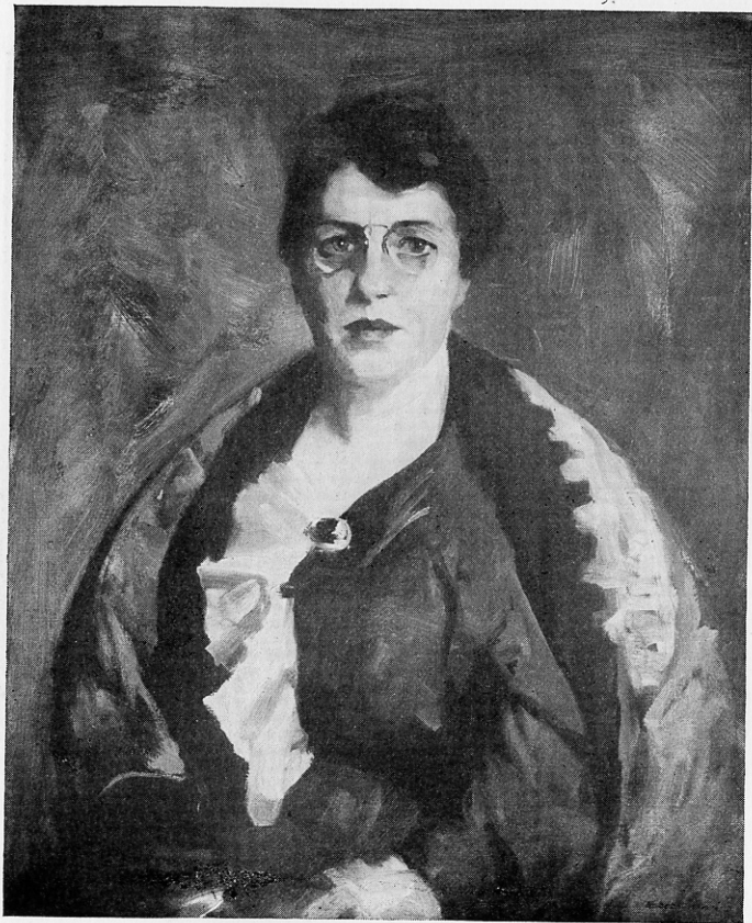
PORTRAIT OF EMMA GOLDMAN