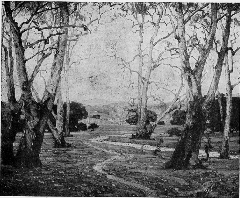
THE GROVE WILLIAM WENDT