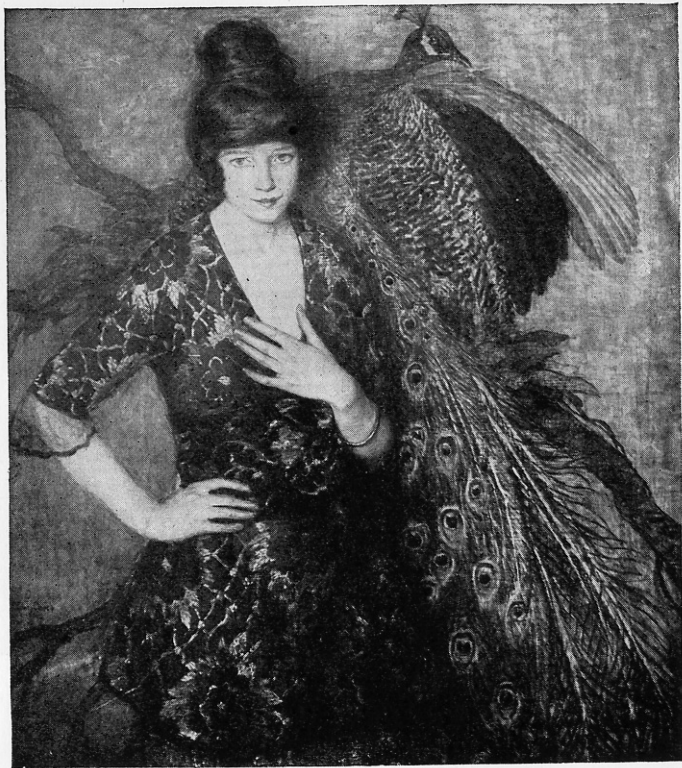
THE PEACOCK GIRL F. EDWIN CHURCH