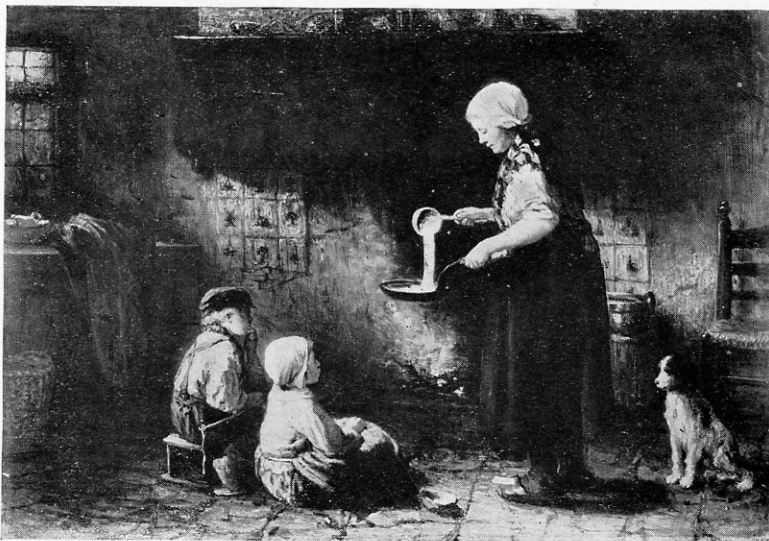
'The Pancake' by Josef Israels