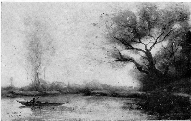
"The Pool At Ville d'Avray" by J. B. C. Corot