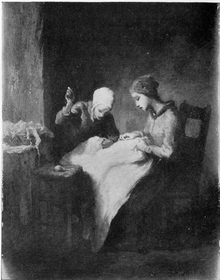
"Les Couturieres" by J. F. Millet