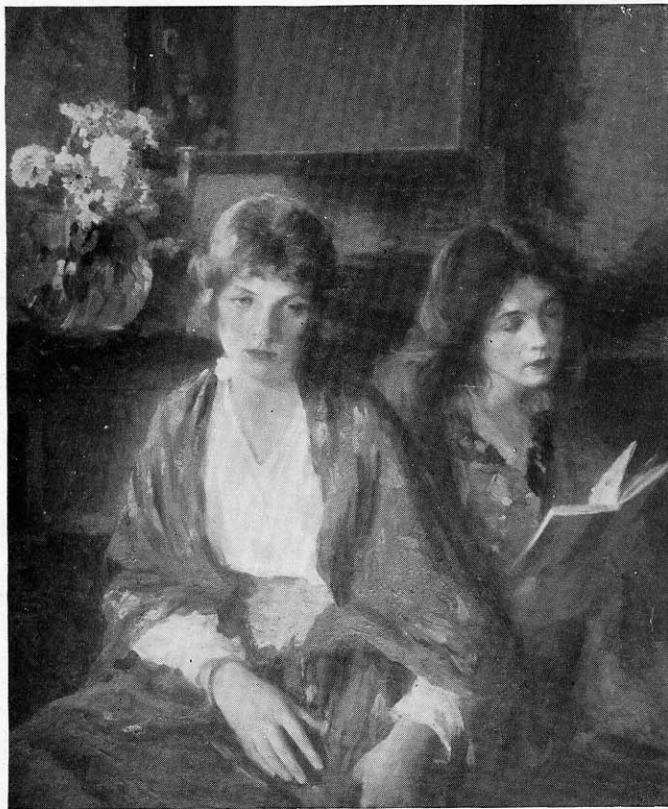
"Two Girls" by Ivan S. Olinsky.