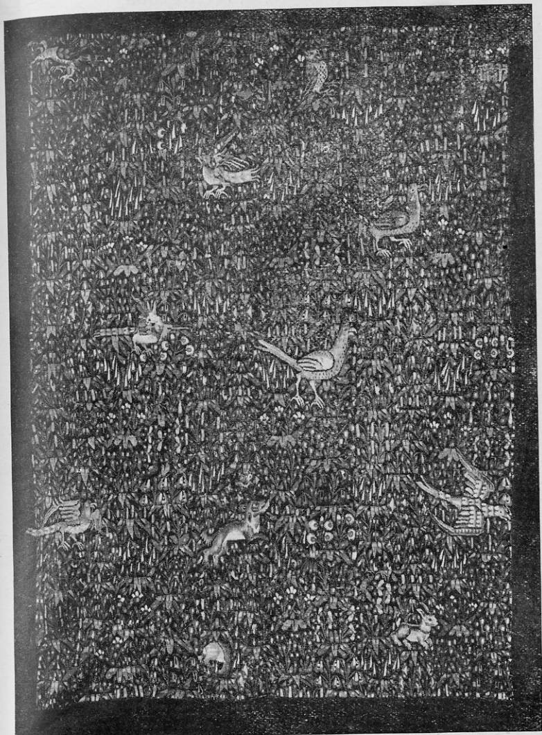
XV CENTURY FRENCH MILLE FLEURS TAPESTRY