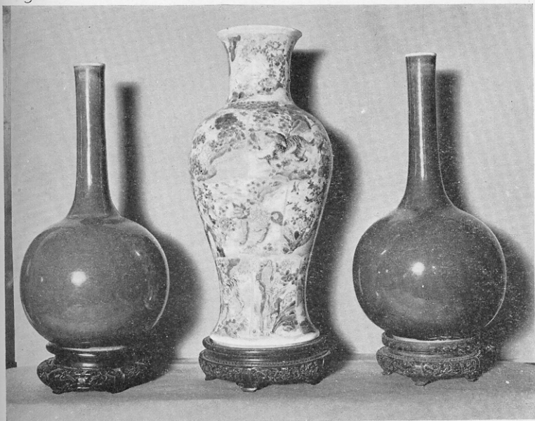
SANG DE BOEUF FAMILLE VERTE SANG DE BOEUF

Chinese Porcelains of the Kang Hsi Period, 1662-1721