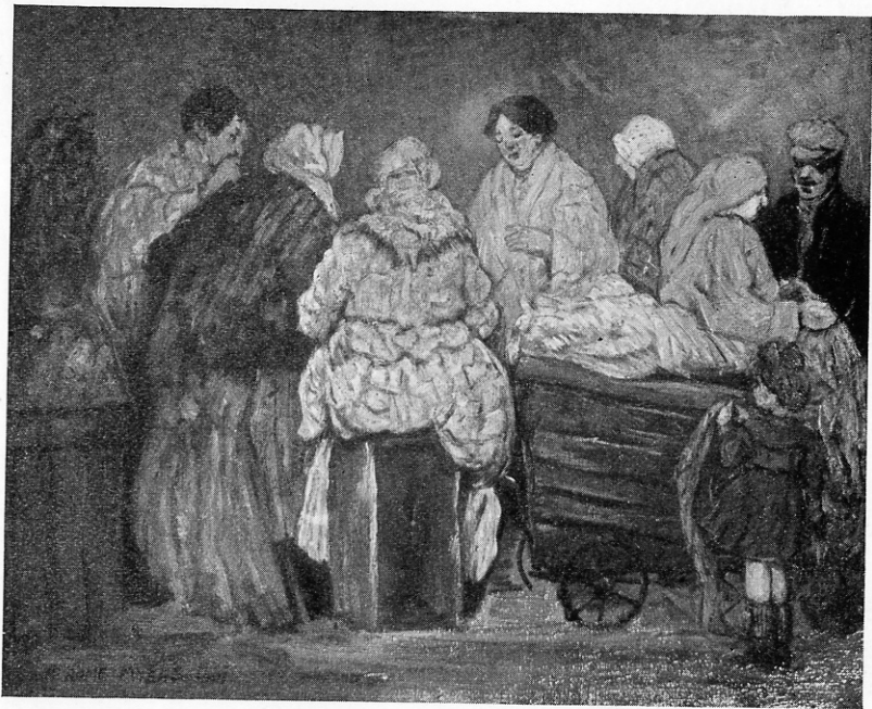
"The Market," by Jerome Myers