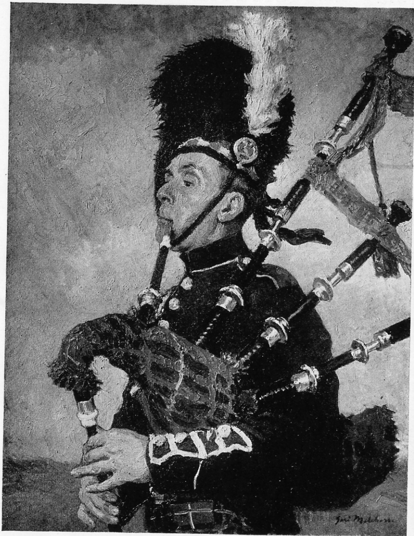
"The Piper," by Gari Melchers