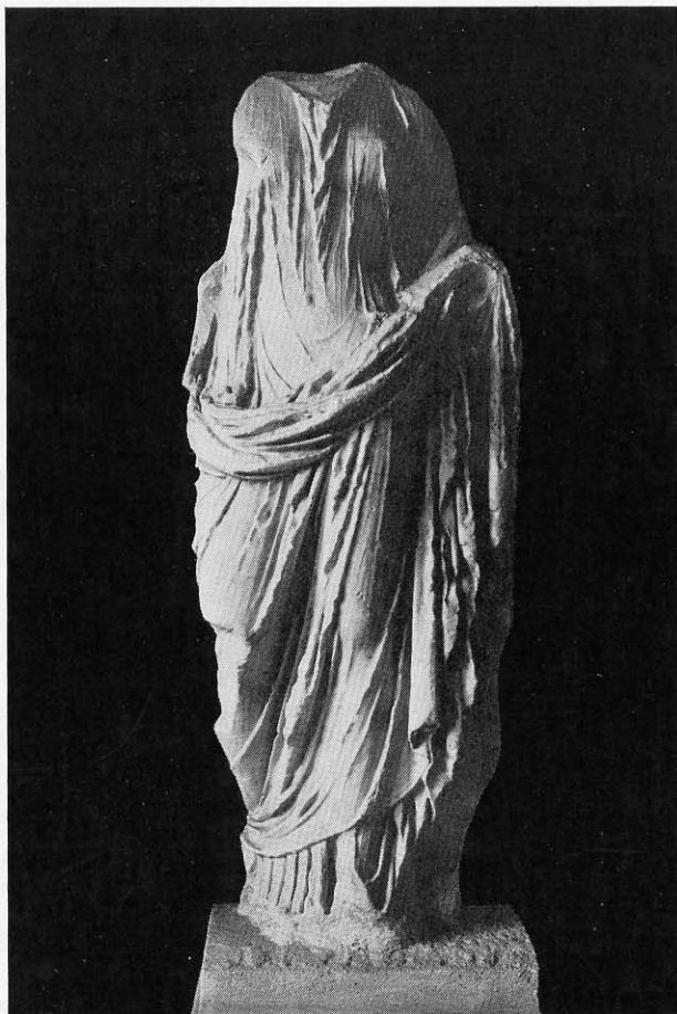
DRAPED FEMALE TORSO ATTIC IV CENTURY B. C. Purchased