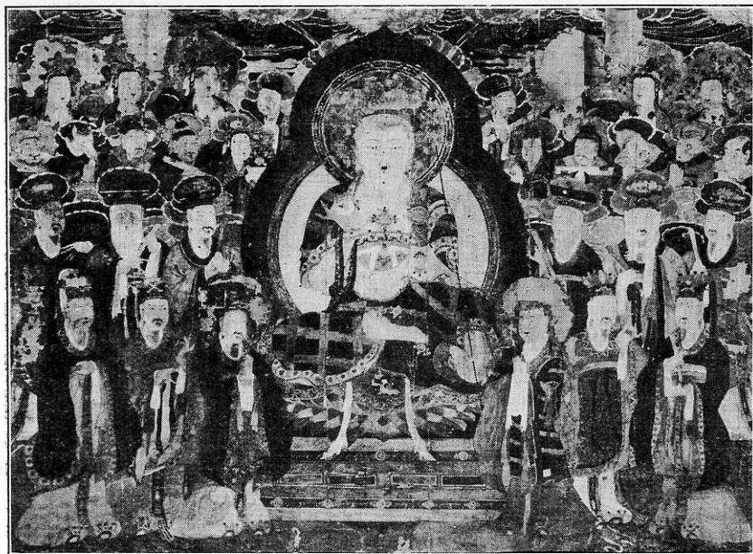
KOREAN TEMPLE PAINTING OF THE KOREI PERIOD Purchased