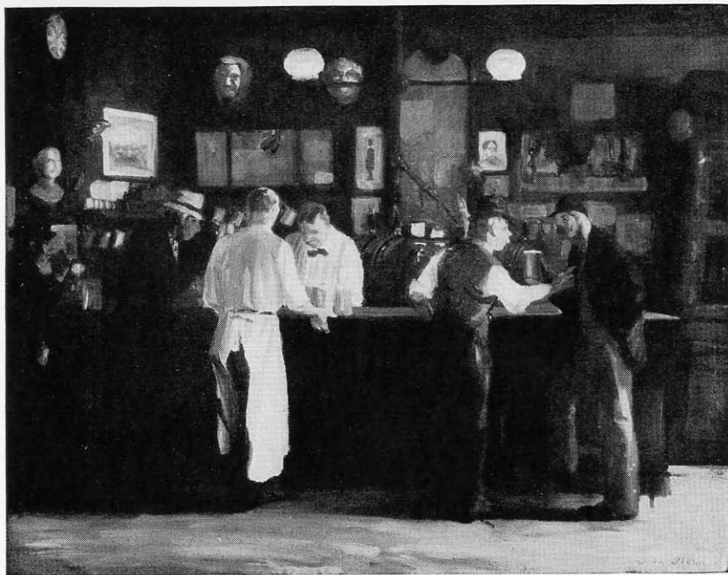
"McSORLEY'S BAR" JOHN SLOAN

Presented by Detroit Museum of Art Founders Society