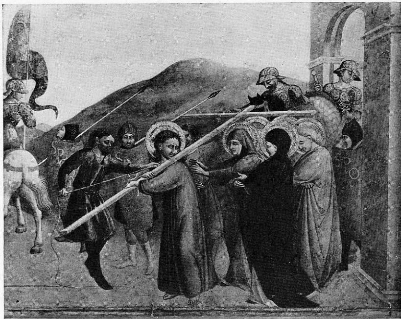
THE PORTATION OF THE CROSS STEFANO DI GIOVANNI, CALLED SASSETTA (1392-1450) Purchased

miniature painting dating from about 1400, have added tremendously to the richness of our Italian period rooms planned for the new building.