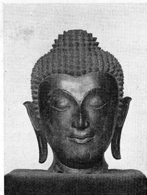
BRONZE HEAD OF BUDDHA SIAM—XII-XIV CENTURY Purchased