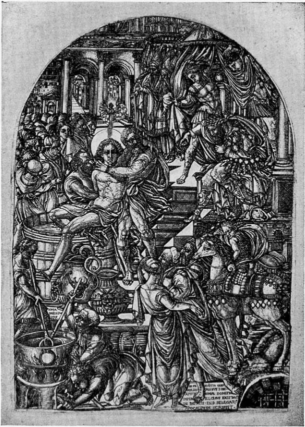
"MARTYRDOM OF ST. JOHN," BY JEAN DUVET. RECENTLY PURCHASED.