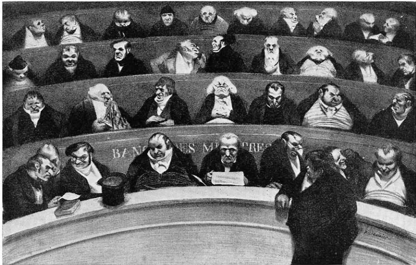
"LA VENTRE LEGISLATIF," BY HONORÉ DAUMIER. RECENTLY PURCHASED.