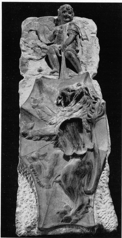
COAT-OF-ARMS OF THE MINERBETTI BY DONATELLO, ITALIAN (FLORENCE), 1386-1466 Gift of Mr. and Mrs. Edsel B. Ford, 1941