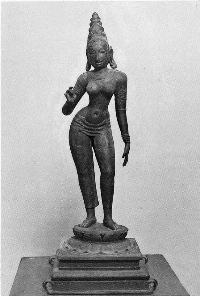
UMA SOUTH INDIAN, FOURTEENTH CENTURY Gift of the Sarah Bacon Hill Fund, 1941

Buddhist bronzes are represented in our collection by one example, a brass figure of Padmapāṇi with two attendants. 1 Padmapāṇi is one form of Avalo-