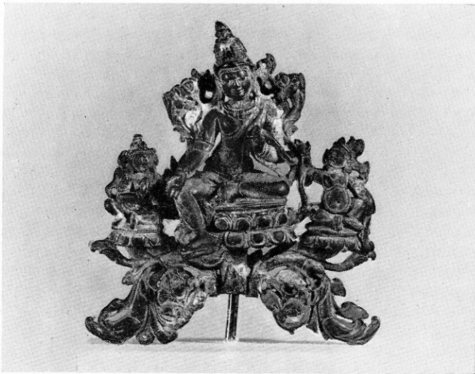
PADMAPĀNI INDIAN. BENGAL, ELEVENTH CENTURY Gift of H. Kevorkian, 1925

dition for Indian sculpture came from men of the older generation; the praise of a great sculptor such as Rodin was overlooked or ignored by the younger artists and critics.