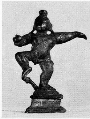
BĀLA KRŚNA SOUTH INDIAN, SEVENTEENTH CENTURY Purchased by City Appropriation, 1927

kiteśvara, the fourth Dhyāni-Bodhisattva, a god of compassion and mercy who renounces his place in heaven until the last living being shall be saved. Padmapāni represents the Indian and the Buddhist ideal at its most human level. He sits on a lotus throne with his right hand in the gesture of charity ( varada hasta ), while the left holds a long-stemmed lotus ( padmā ). His two attendants are in worshipping or adoring positions. The handling is loose and free, while the adoption of a joined, twisted, and applied technique is well suited for modelling in wax and casting in metal. Forms are modelled in an indicative way and then outlined by thin strips, thus approximating a linear style. The profuse nature of the symbolic lotus ornament gives this bronze an air of elaboration that coincides with the period of its making: eleventh century Bengal, the last stronghold of Mahāyāna Buddhist learning in India, and a goal for pilgrim and scholar alike. 2