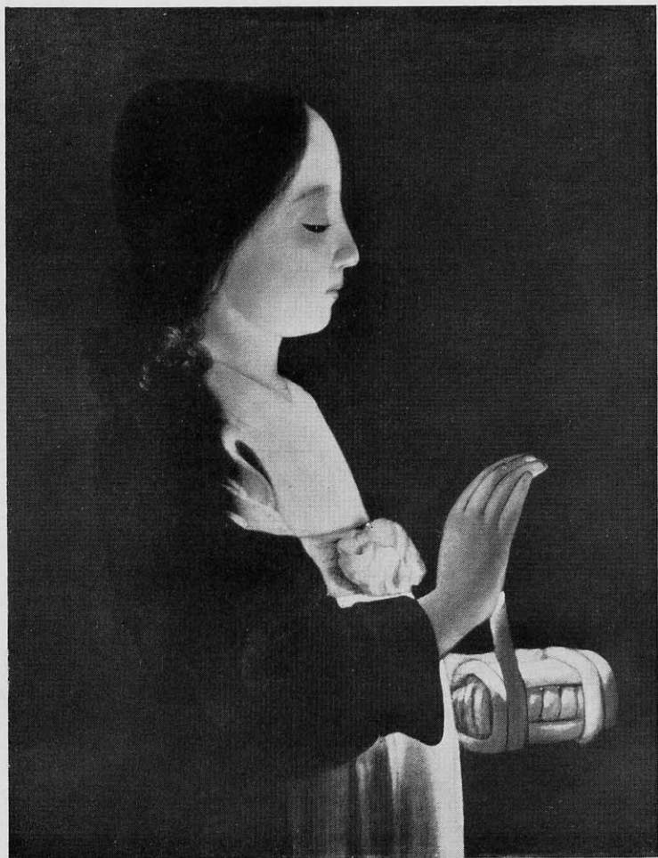
A GIRL HOLDING A CANDLE GEORGES DE LA TOUR FRENCH, 1593-1652 GIFT OF THE FOUNDERS SOCIETY