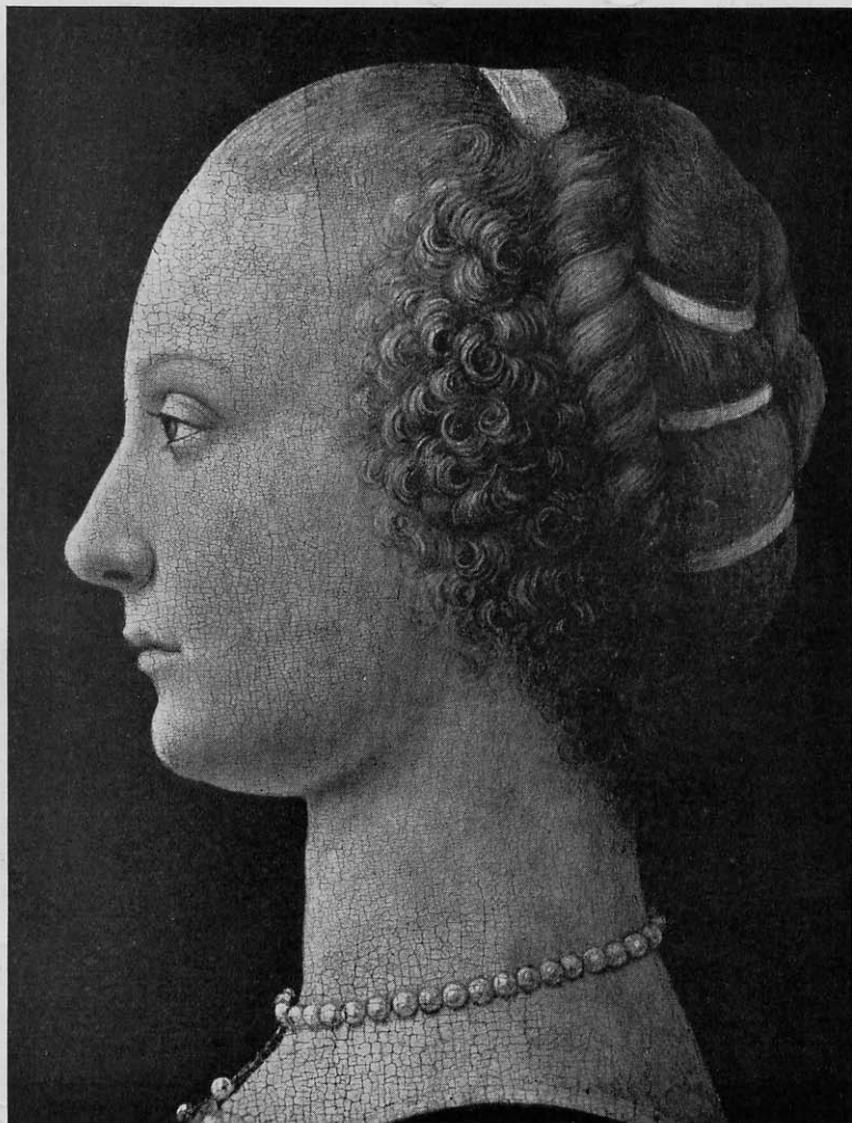
PORTRAIT OF A YOUNG WOMAN

VERROCCHIO OR LEONARDO. FLORENCE, C. 1475