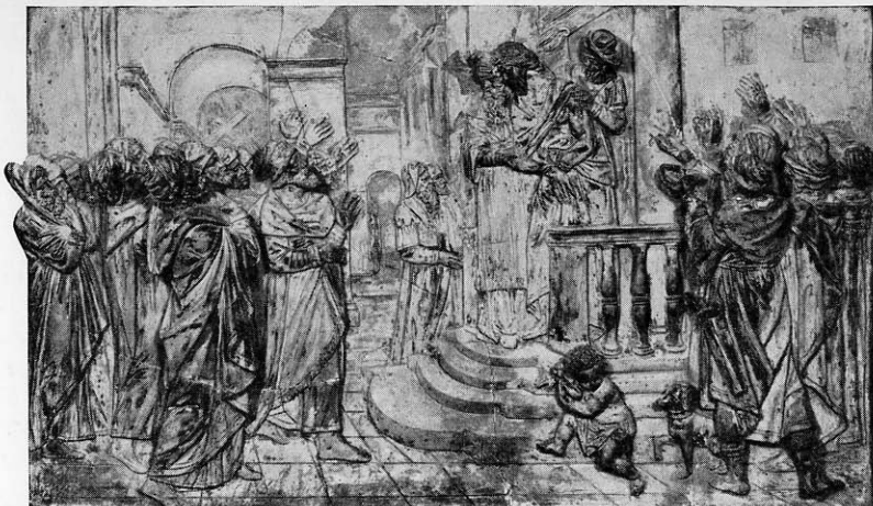
CHRIST SHOWN TO THE PEOPLE (BAS-RELIEF)