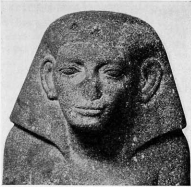
PORTRAIT BUST EGYPTIAN MIDDLE KINGDOM