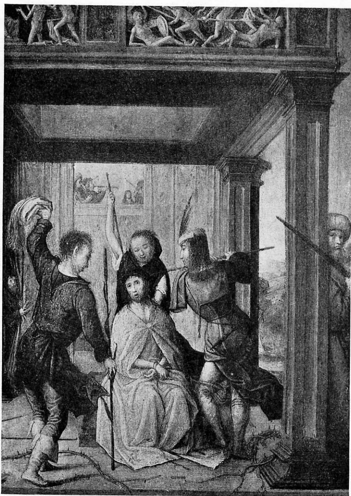
CHRIST CROWNED WITH THORNS JUAN DE FLANDES FLEMISH 1470-1519