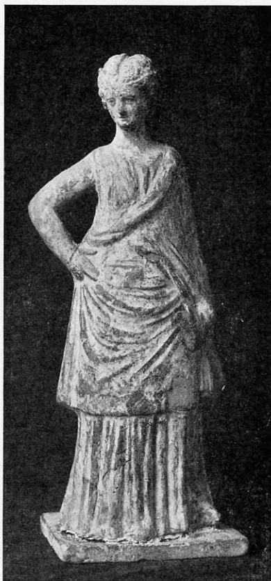
TANAGRA FIGURINE GREEK IV CENTURY B. C.

The most important additions to the later and contemporary American galleries were the painting, The Promenade , by William Glackens, The Ramparts, Quebec , by Preston Dickinson, and the