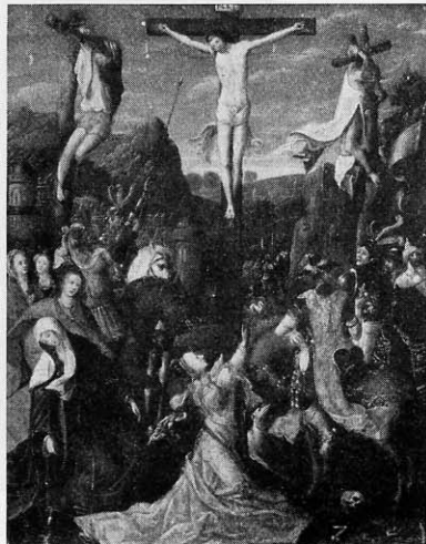
THE CRUCIFIXION SCHOOL OF ANTWERP, XVI CENTURY

In addition to these there was shown in January, as usual, the annual exhibition for Michigan artists, a competitive exhibition of local works selected by a jury; in April and May the fifteenth exhibition of contemporary American art, which aims to show the best work being done in America at the present day; during February, a collection of painted and printed fabrics of the eighteenth century, including India prints and their European imitations from Italy and Spain, as well as French and English printed cotton; in June, July and August a collection of modern