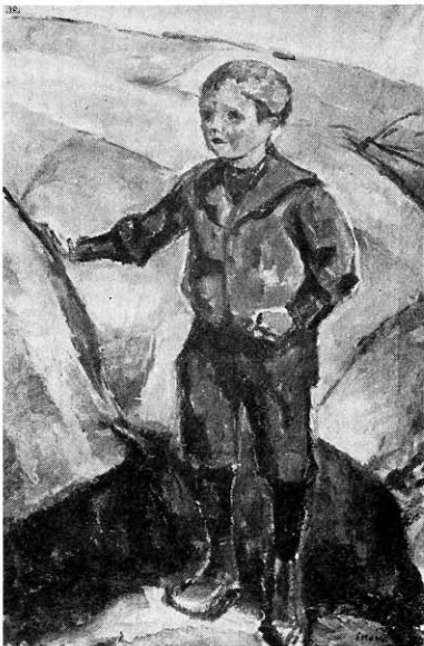
BOY IN BLUE EDWARD MUNCH

Accessions to the Asiatic collections during the past year included a number of unusually important pieces. Chief of these was the scroll painting, Early Autumn , by the thirteenth century Chinese master, Chi'en Hsüan, the gift of The Museum of Art Founders Society, and a work of such a quality that it would be significant in any collection. Among many opportunities offered for the acquisition of Chinese sculpture during the year, several were taken advantage of to our credit. The large bronze Maitreya is rivalled in kind only by one other piece. The copper portrait mask is the only perfect one of its type known. The large stone bhikshu and the graceful votive stele, both of the Sui dynasty, are fine examples of an art that is becoming increasingly difficult to secure. Five tomb figurines—a pair of guardians of the Northern Wei dynasty, two court ladies and an exceptionally lively equestrienne of the T'ang dynasty—are notable pieces of ceramic sculpture; while the splendid little lacquered wood figure of Shakyamuni as an ascetic receives appreciative attention from experts as well as casual visitors. Bronze and ancient jade, heretofore unrepresented, may now be seen in the yu or wine vessel, the symbol of Earth, and