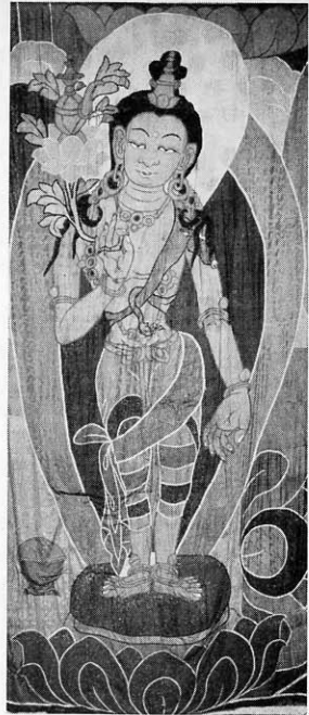
AN ATTENDANT BODHISATTVA FRAGMENT OF A TIBETAN TEMPLE BANNER