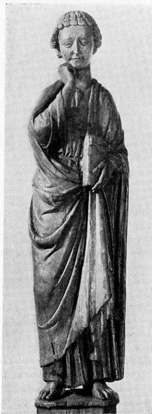
ST. JOHN THE EVANGELIST ILE DE FRANCE, XIII CENTURY

To the growing collection of early Italian paintings—the school of outstanding importance among all European schools of earlier periods—several excel-