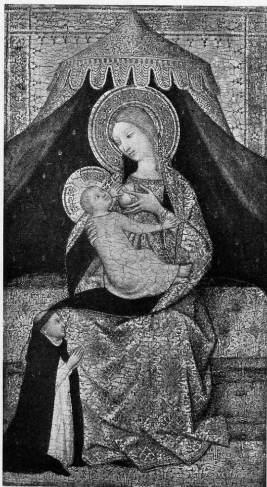
MADONNA AND CHILD