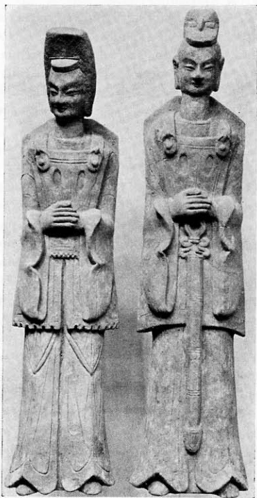
TWO TOMB GUARDIANS CHINESE V CENTURY

Within the year arrangements were made for a series of Saturday morning