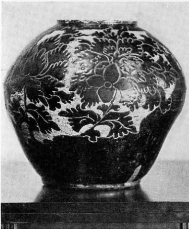
TZ'U CHOU VASE CHINESE, SUNG DYNASTY

The growth of the Print Collection during the past year was most satisfac-