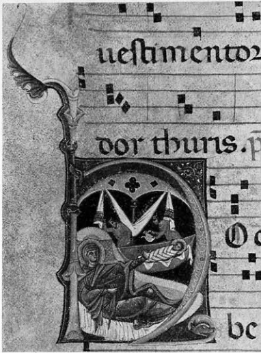
ILLUMINATION FROM A PAGE OF AN ANTI-PHONAL ITALIAN, XIII CENTURY