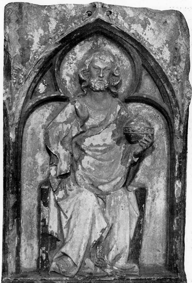
CHRIST ENTHRONED ILE DE FRANCE, XIV CENTURY

a craftsman was also an artist of high rank and when loving care and devotion and days and weeks of patient labor went into the making of objects which to-day are turned out by scores of hundreds by the soulless machines of our boasted era of speed and efficiency. Perhaps the most outstanding example of this perfection of handicraft is the marvelous little clock in the form of a miniature Gothic chapel, made for that fastidious ruler, Philip the Good of Burgundy, in the early days of the fifteenth century, thus making it one