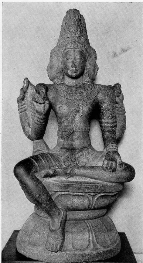
BRAHMA IMAGE INDIA. X-XI CENTURY