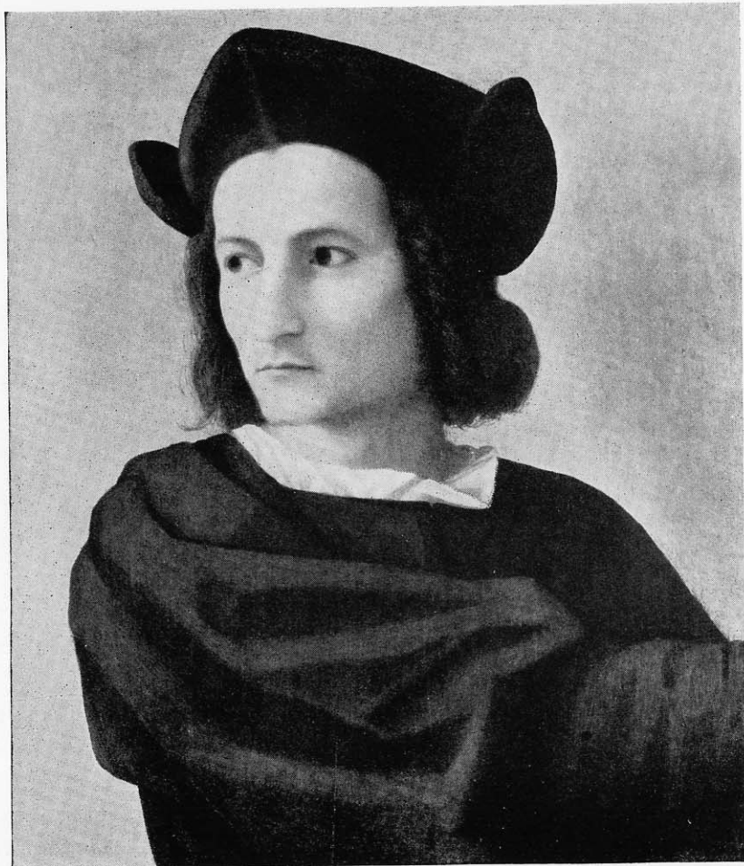
PORTRAIT OF AN ARTIST FRANCIABIGIO (FRANCESCO DI CHRISTOFANO) FLORENCE. 1432-1525 GIFT OF SIR JOSEPH DUVEEN

pupil of Mariotto Albertinelli, he was indirectly influenced by Leonardo and Raphael. Having no temperamental affinity with, he remained entirely outside of the artistic current which Michelangelo had set in motion. At an early age he met Andrea del Sarto, forming an acquaintance which grew into a close friendship and resulted in the establishment of a joint atelier. Franciabigio, being inferior