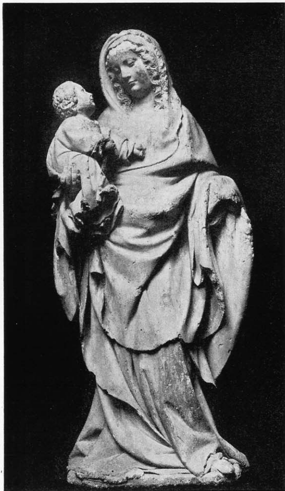
MADONNA AND CHILD BURGUNDIAN, EARLY XV CENTURY

would indicate that mille fleurs tapestries were already woven at Arras and not only at Tournai or in Touraine as is generally believed.